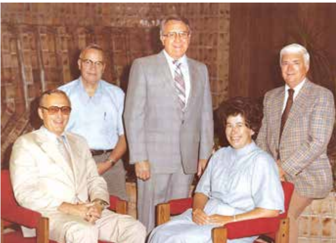
EARLY BOARD MEMBERS:

Thank you donors for helping the Foundation grow and make a difference in our community.