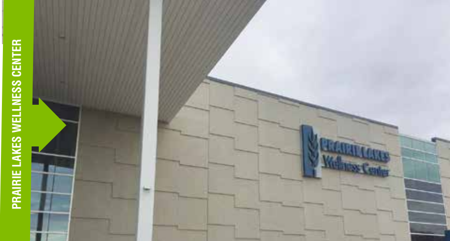
PRAIRIE LAKES WELLNESS CENTER