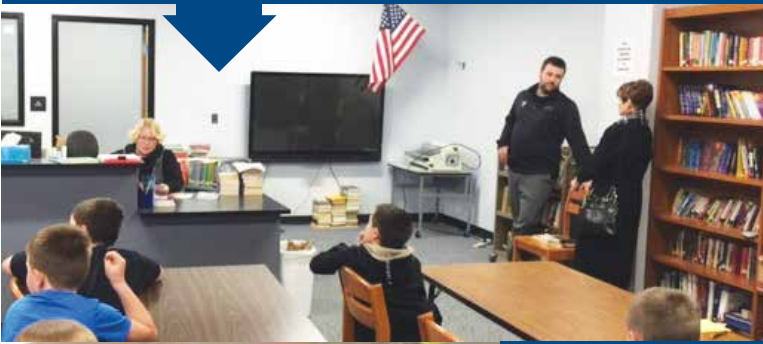
WAVERLY-SOUTH SHORE SCHOOL