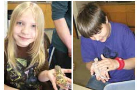
LAZS Wildlife Warriors program at Bramble Park Zoo.

My gift of $ _____ to the Watertown Area Community Foundation is enclosed.